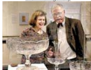
View the Photo Gallery for A cut above